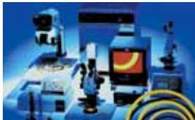
Quality & Technical